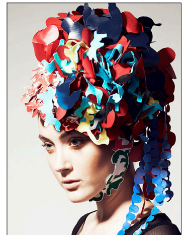
Featured in Tokion magazine

I believe that art is a powerful tool; it can help to inform and share important messages and it can also make one dream and let go of everyday schedules, rules, and restrictions. Art can make the viewer smile and also convey a message and a deeper meaning. When I created the Sami Northern Light Collection in 2011, I wanted to bring awareness to the neglected Nordic Sami people by creating pieces that celebrated and communicated their story. It is very important for me to make a difference by raising awareness through my art. Being part of a Scandinavian artist group while living abroad is an inspiration, a community, with a lovely connection to “home.” I’m looking forward to seeing Nordic 5 Arts grow and become more visible on different online platforms, and also in the real world at museums, galleries, and pop-ups.” emmalundgren.com