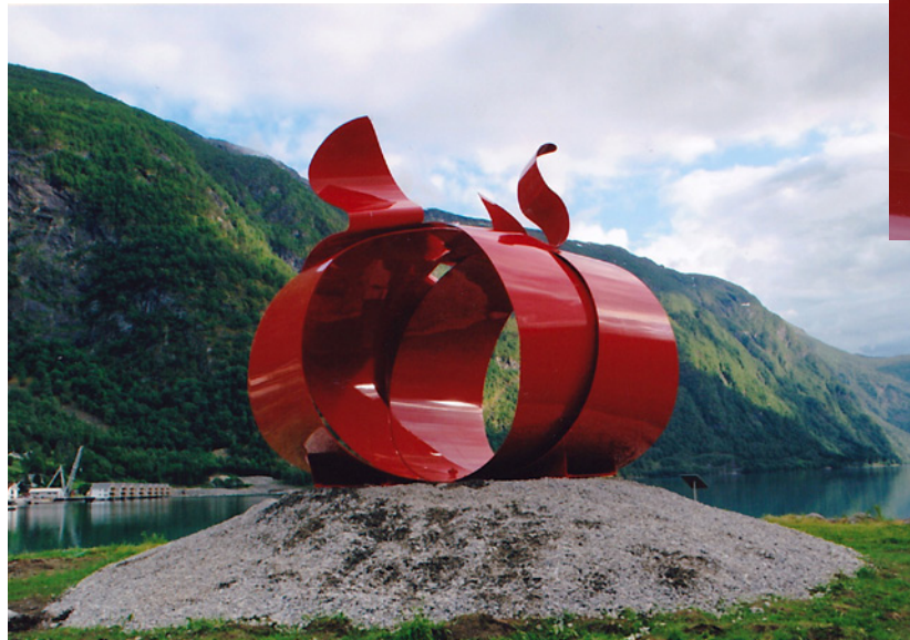
"Jonsok" by Kati Casida was unveiled in Skjolden, Norway, June 23, 2011. Painted aluminum, 10" x 10" x 10"

*The summer solstice is celebrated by numerous countries and differs according to country and culture. Midsummer's Day is also known as St. John's Day. In Norway, it is called "Sankthansaften," celebrated on June 23 with large bonfires. A second name used is "Jonsok," meaning "John's wake."