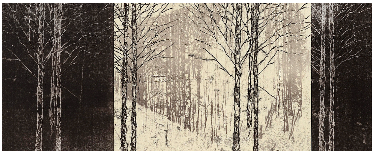
Below: Örebro 1, Trace Monotype, 20” x 32”