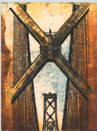
Bay Bridge 1