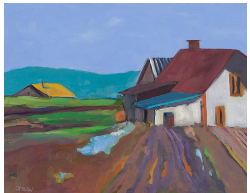
Living in the Context of All That Earth, Oil on wood panel, 14" x 18", 2011