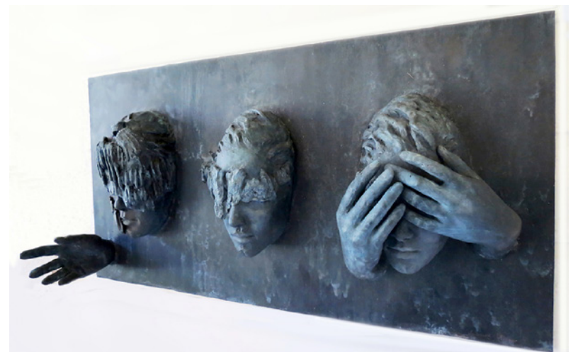
Blind to Reality, Bronze, 16" x 32" x 8"