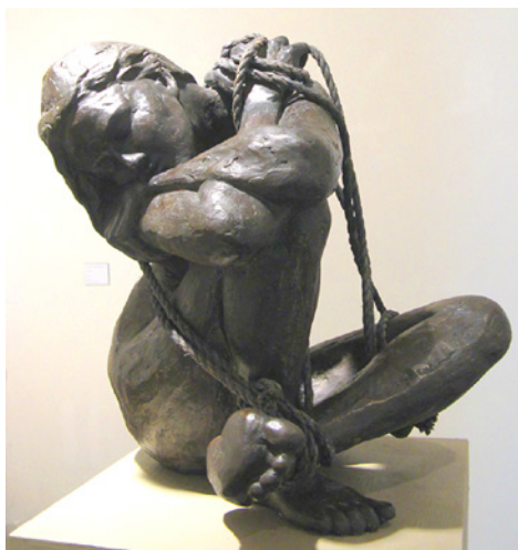
Bound Figure, Bronze, 20" x 19" x 17.5"