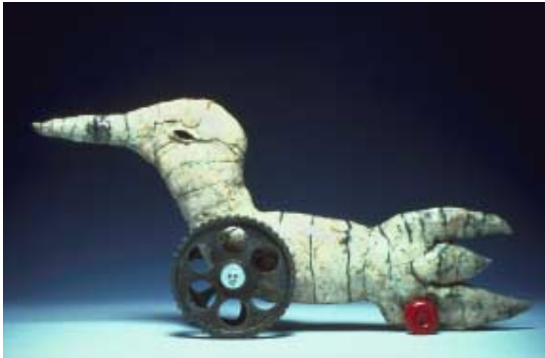
BIRD WHEELS Clay, gears, wood; L2' H11" D6"