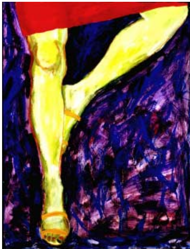
SLIP-INS Mixed media on paper, 44" x 32"