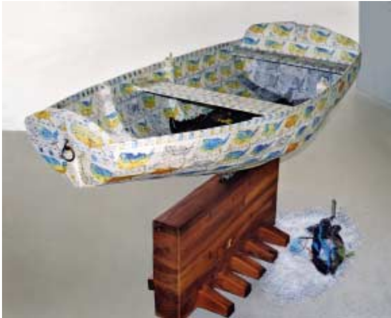
BOAT Mixed media