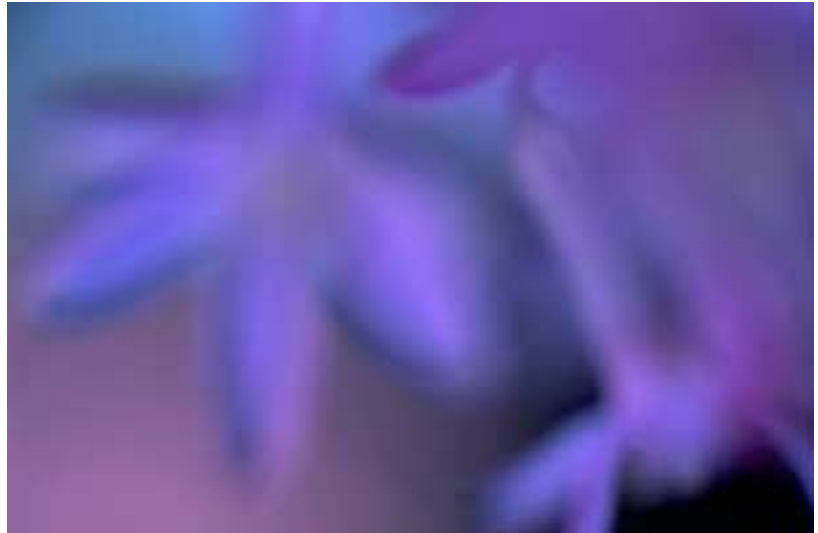
PURPLE STAR (Through Tears Series) Photography, C-print; 16" x 20"