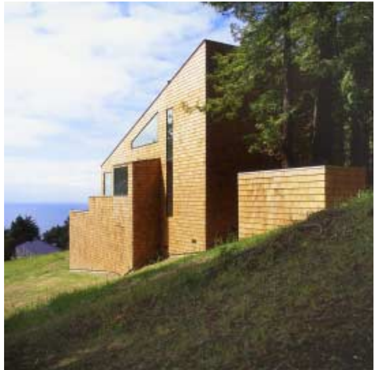
SEA RANCH RESIDENCE The Sea Ranch, California