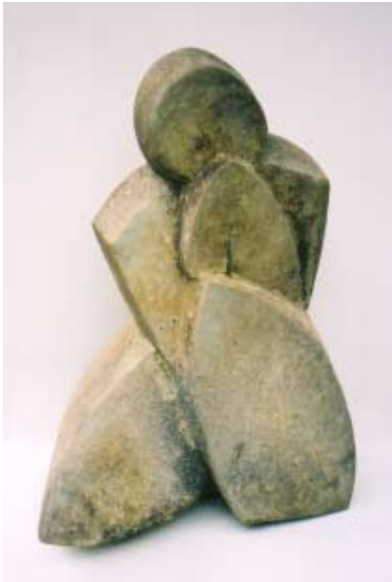
KANNA II Bronze; H17" W12" D6"