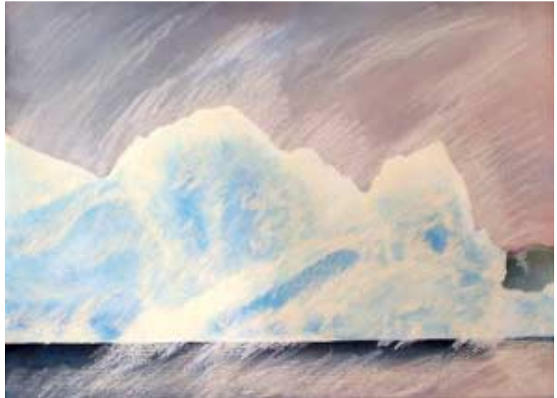
ICE MOUNTAIN - GREENLAND Watercolor, pastel; 27" x 34" framed