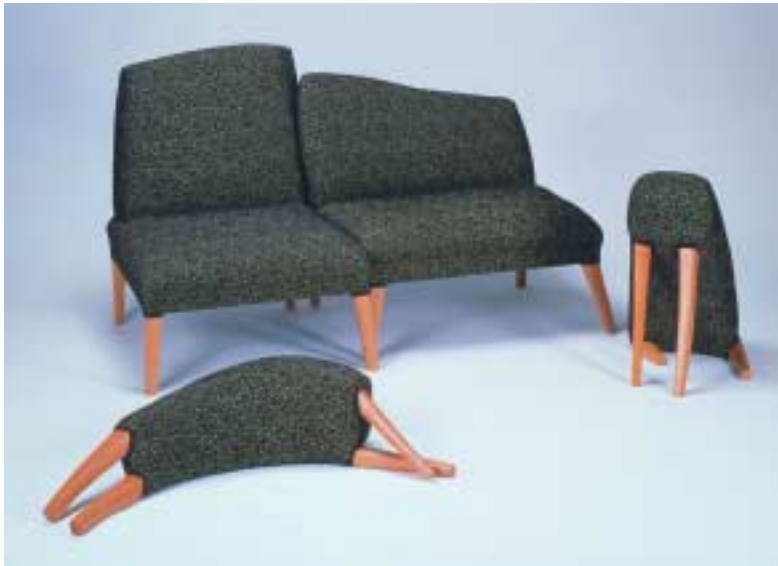
MAMMALS Furniture - wood, textile