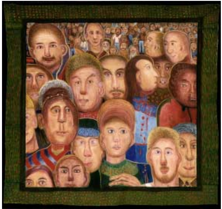
THE MARCH OF MEN

Mixed media on unstretched canvas; 62" x 59"