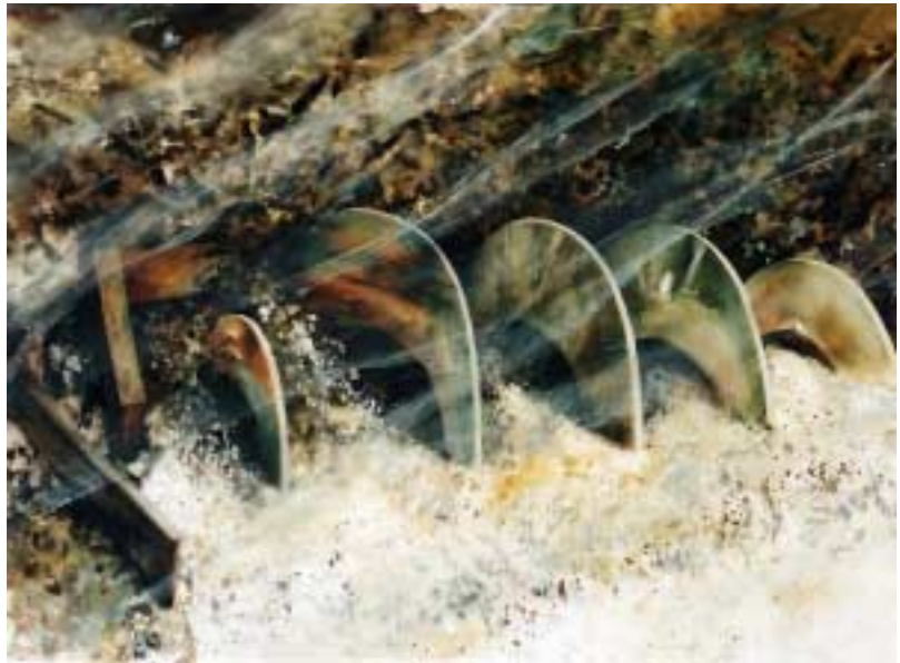
AFTER PIRANESI/AFTER US #4 Oil and acrylic on canvas; 36" x 48"