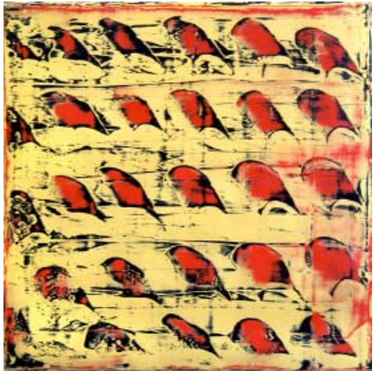
MYTHOLOGY OF MEMORY Mixed media on canvas; 15" x 15"