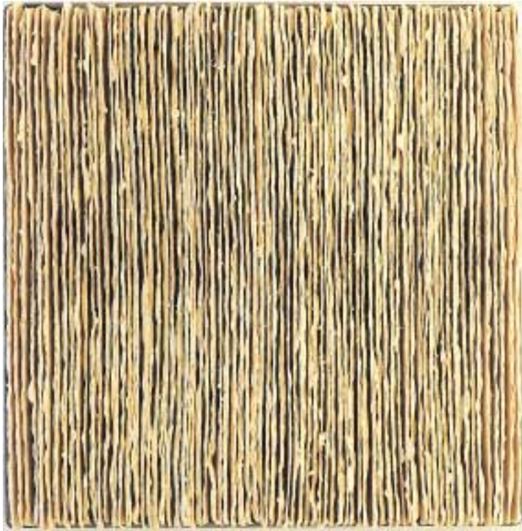
EDGES (One of seven elements) Handmade paper, mixed media, L12" W12" H1.5"