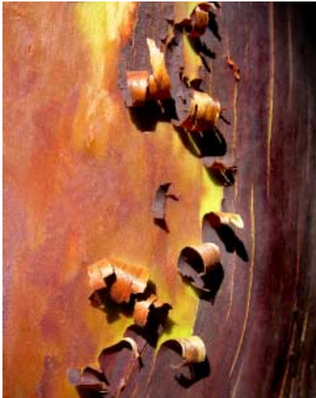
BARK SERIES XXVIII (Manzanita) Photography, Giclee print; 20" x 16"