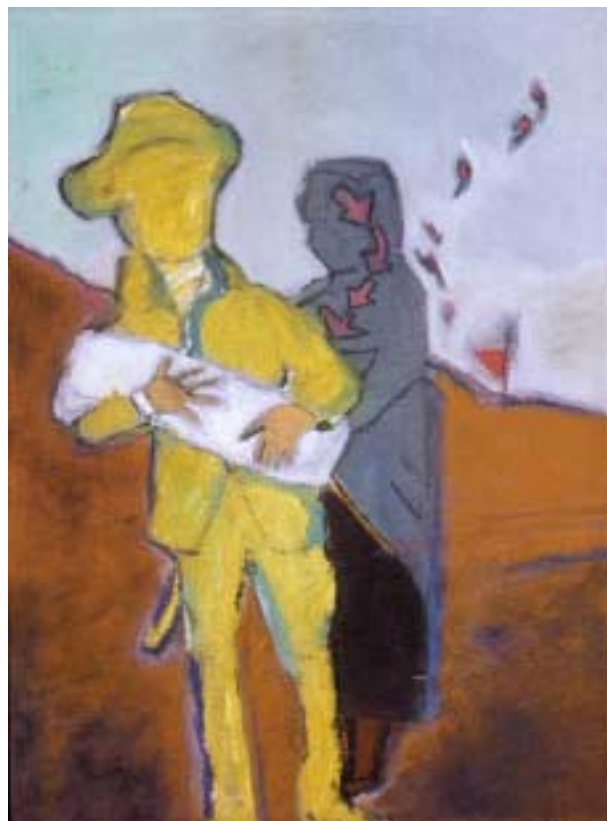
TRUCE Oil on canvas; 16" x 13"