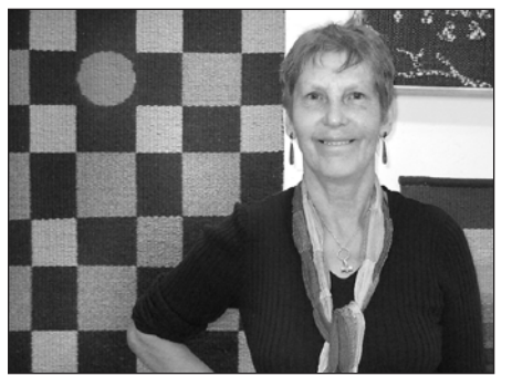
May 5 and 6, 2007, Fort Mason, San Francisco

for nordic 5 arts and for each of the artists. See posting on artists, www.norwayday.org