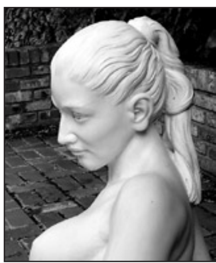
Essence (detail), Marble, 22" x 50" x 18