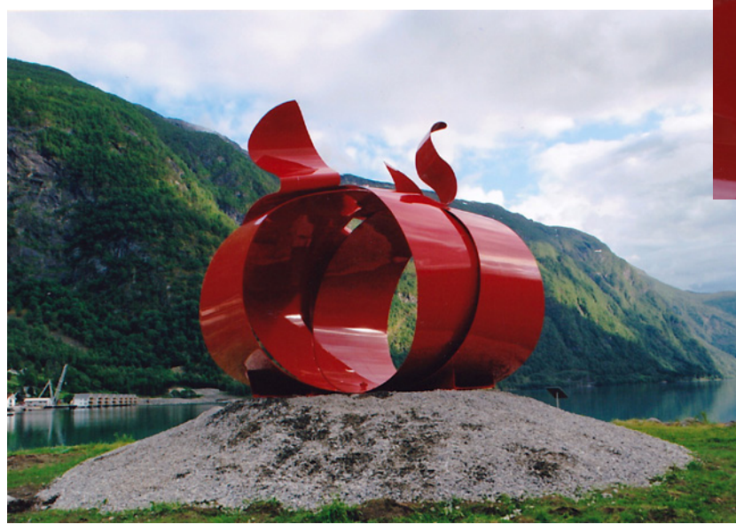
"Jonsok" by Kati Casida was unveiled in Skjolden, Norway, June 23, 2011. Painted aluminum, 10" x 10" x 10"

*The summer solstice is celebrated by numerous countries and differs according to country and culture. Midsummer's Day is also known as St. John's Day. In Norway, it is called "Sankthansaften," celebrated on June 23 with large bonfires. A second name used is "Jonsok," meaning "John's wake."