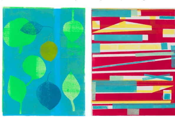
visit artist pages on nordic5arts.com

For most of my career I have been a painter of large abstract oil paintings. Though I also started making monotypes in 2006, it was sporadic because I always had to take a class or rent the press. In December 2012, I was fortunate to acquire my own press (a 500-lb Griffin, such a beautiful old machine!) and have been concentrating on monotypes. This has been a major shift for me because making monotypes is so spontaneous: I work quickly and intuitively and it's quite experimental and freeing. In printmaking, I give myself surprises that I respond to, constantly adding more color or another shape and reprinting in layers, until I reach the composition I want. Working with new equipment has opened me to using new materials that I am drawn to, like the leaves I collect on a walk ("Lake Leaves" below left), or arranging cut paper to create distinct geometric designs ("Metropolitan" below right). Inspired by this new process, I have hardly painted since getting the press. I intend to return to those canvases soon and I predict that some of the spontaneity I've practiced will find its way into my new paintings.