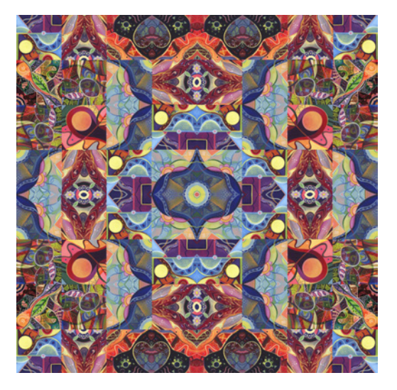
The Joy of Design Series Mandala Series Puzzle - Arrangement 1

I have been working on "The Joy of Design Series," small square acrylic paintings that are designed to hang in any direction, including diagonally, either alone or in alterable groupings with each other, with space or no space in between the paintings. There are currently 15 original paintings in this series and I have created some digital paintings/collages out of the scans of these paintings. It is my intention to invite art lovers to create their own arrangements of the available giclee prints in any formation that they may want to display this art. Giclee prints in a variety of sizes and options as well as greeting cards are available at FineArtAmerica.com.