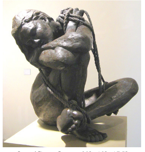
Bound Figure, Bronze, 20" x 19" x 17.5"