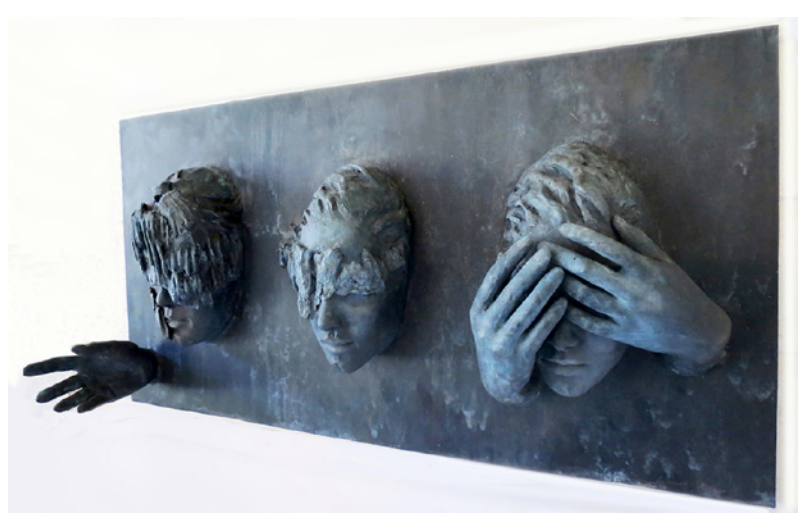
Blind to Reality, Bronze, 16" x 32" x 8"