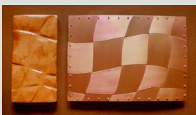
Maj-Britt Hilstrom, Woven Wave V , French red marble and titanium diptych, 8.75" x 17" x 0.75"

Clockwise from upper left: Kristin Lindseth, Tatiana , Bronze, 12" x 4" x 6" Pat Bengtson-Jones, Ancient Ruins III , Bronze, 7" x 3.5" x 4" Kati Casida, Firefly , Painted aluminum, 19" x 30" x 11"