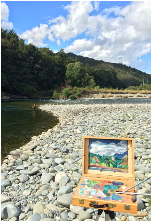
Fishing and Painting in New Zealand.

Friendly local "Kiwis" helped us find many places to fish and paint all over the country. For example, in Glenorchy, we were told to go through a certain gate and follow a muddy cow path for a few miles to reach a small lake called Diamond Lake. Accompanied by sheep calling each other from opposite sides of the lake, I set up my easel by the lake and painted while the mountains slowly shifted from cool blue to warm violet. I had limited my palette to six colors and I mixed and mixed to try to capture the saturated turquoise glacial water, the various green hues of the trees I didn't know the name of, and the color of the sky with dramatic grey clouds. The sky was different in New Zealand. It was warmer, bluer and lighter. I added more titanium white and then a touch more ultramarine blue. "I caught one!" my husband called from the middle of the lake. I smiled and thought to myself: "Fishing and painting! What a wonderful way to live!" and then I looked carefully at the sky again.