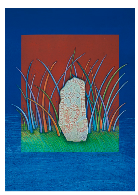
"The Runic Stone on Frösön, Sweden" by Maj-Britt Hilstrom Archival pigment print on canvas, 5' x 3', 2016

\hbox{\it "Runes Revealed"} \hbox{\it exhibition catalog:} \hbox{\it www.nordic5arts.com/pages/exhibitions.html}