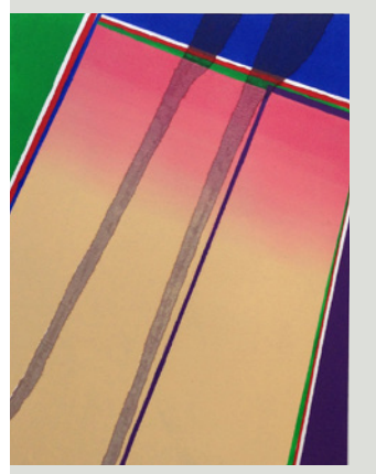
Poem Series, monotype, Chine collé.