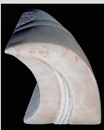
Tsunami, marble. Private collection.