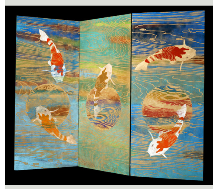
Waterscape, woodblock on leather mounted on wood. Collection of Kaiser Hospital, Oakland.