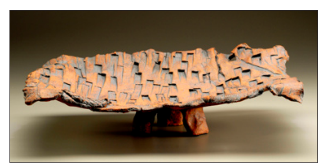
Offering Asana, Ceramic fired with iron oxide, 7'' \times 16'' \times 10'' On display through October 17, 2008, at the Pacific Rim Sculptors Group Exhibition, Carl Cherry Center for the Arts in Carmel, CA

Raku yaki fuses opposites. Fire and earth, water and smoke synergistically produce an object that contains all elements. Surrendering to its unpredictability results in choreographing the interplay between 'out there' and 'in here', and underscores the fact that they are not different.