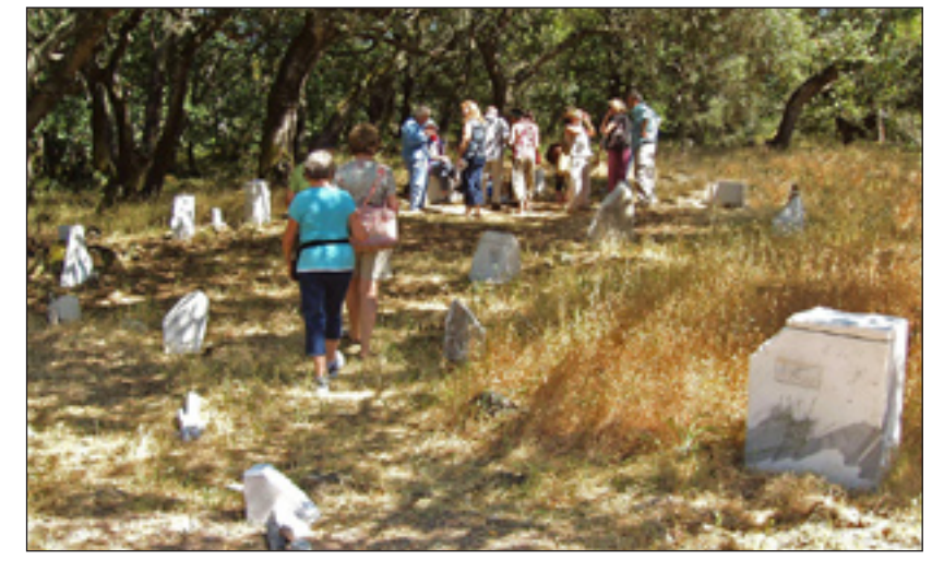
Paradise Ridge Winery is home to Marijke's Grove, a sculpture exhibit nestled in a four-acre grove of ancient gnarled oaks. Within the wooden glens are "galleries" connected by simple footpaths. Sculptures are displayed among mossy rocks and small grassy clearings in this natural outdoor gallery. Marijke's Grove supports the arts by creating an annually changing exhibit space where art, ideas and nature converge.